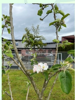
Above: Blossoming Trees at Kilmer and Terry Fox